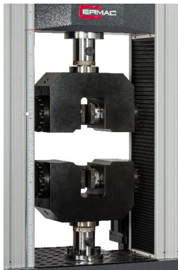
Horizontal clamping Hydraulic grips