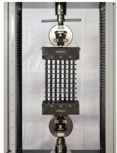
fixture for geogrids and nets